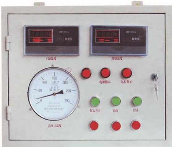
Automatic Temperature Controller