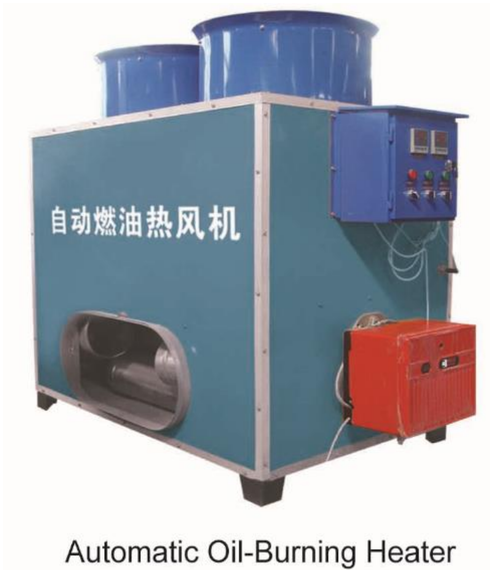
Automatic Oil-Burning Heater